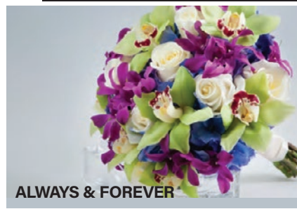
ALWAYS & FOREVER