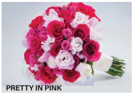
PRETTY IN PINK