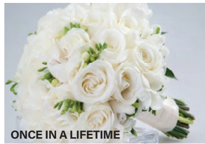
ONCE IN A LIFETIME