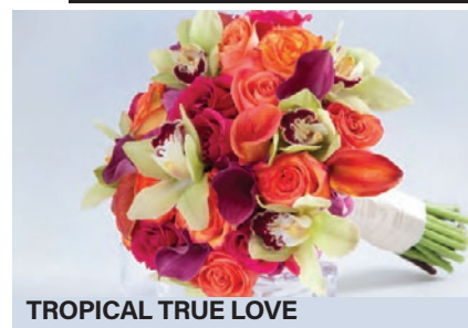
TROPICAL TRUE LOVE